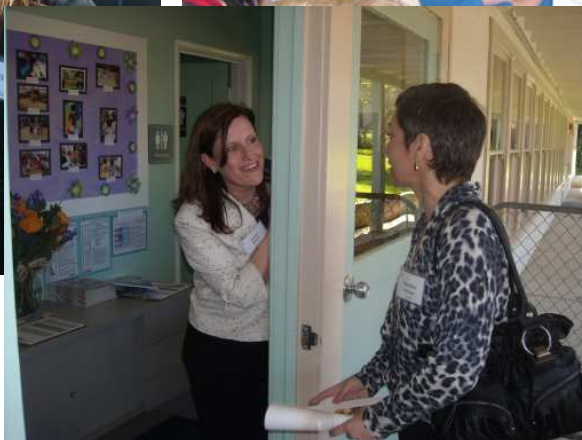
Upper Right: Inside Childhood Learning Center