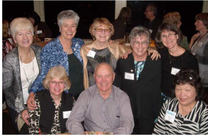
Members of North Central District at the Reception