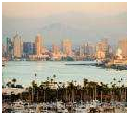
San Diego, California