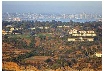
Point Loma Nazarene University San Diego